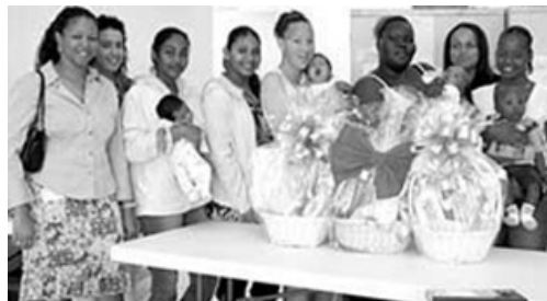
Members of the Young Business & Professional Women's Club make a presentation to the young mothers from the Young Parents' Programme

Programme on "Personal Ethics" including: self esteem building and etiquette.